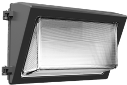
Color: Bronze Weight: 7.9 lbs